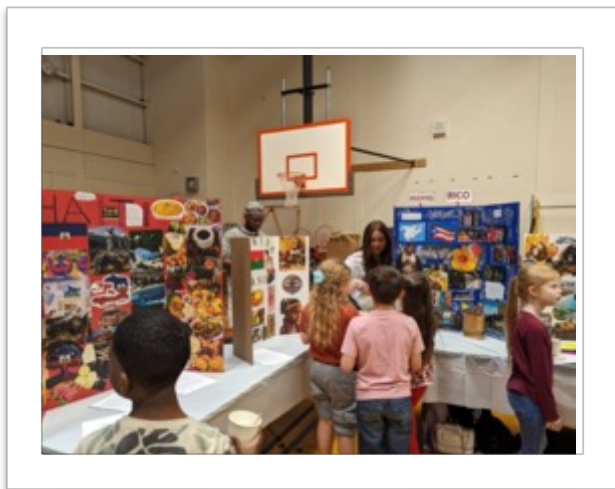
Fort Drum students at the Calcium Primary School Multicultural Day, displaying boards depicting their countries