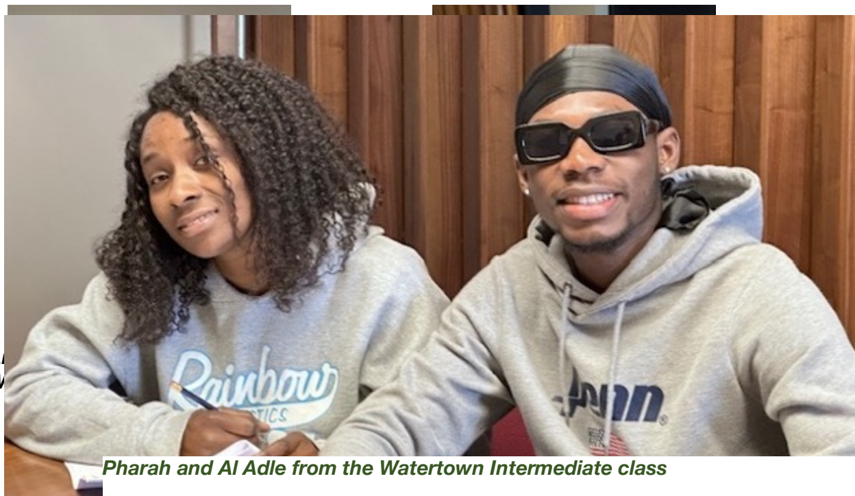
Pharah and Al Adle from the Watertown Intermediate class